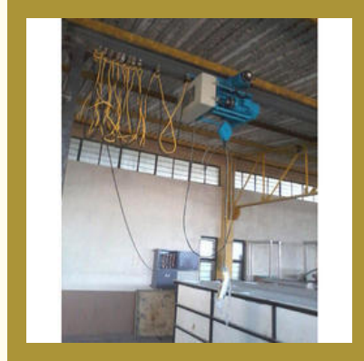
Semi Automation Anodizing Plant