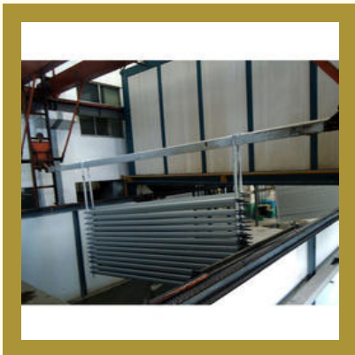
Colour Anodizing Plant