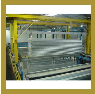
Plain Anodising Plant