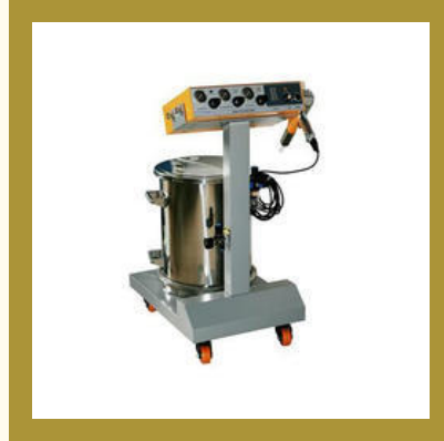
Powder Coating Machine Spraying Gun