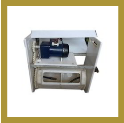
Portable Electroplating Barrel