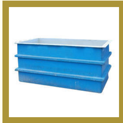
MS FRP Coated Tank