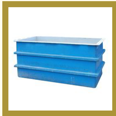
MS FRP Coated Tank