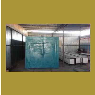
Manual Powder Coating Machine