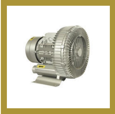
Air Turbine Blower