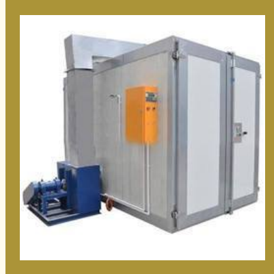
Powder Coating Oven